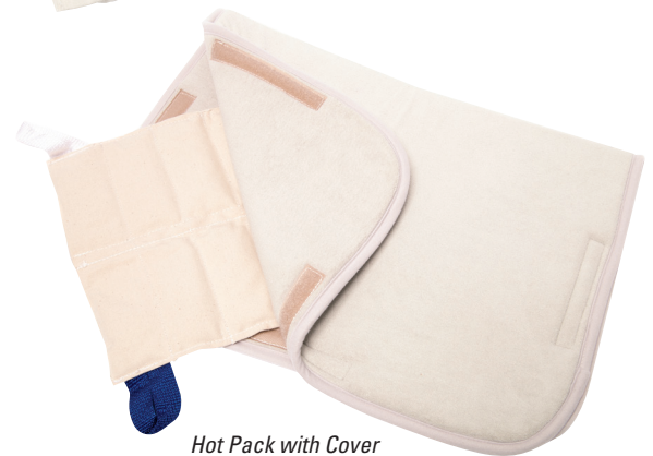
Hot Pack with Cover