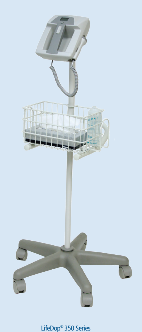
Stand is an optional accessory