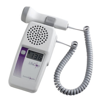
LifeDop® 250 Series