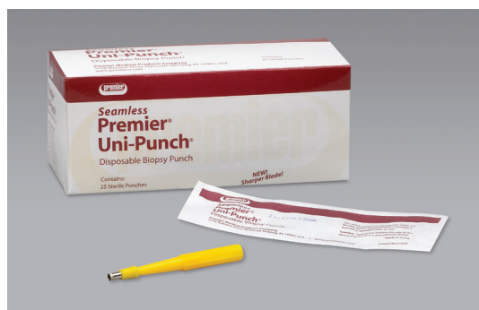
(Assorted - 5 each: 2mm, 3mm, 3.5mm, 4mm, 5mm)