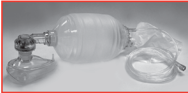
No. 1432 Resuscitator Adult bag mask resuscitator with reservoir. Reusable. (Each)