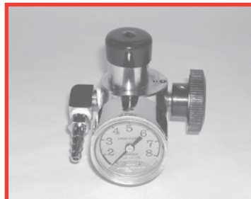
No. 1309A Adjustable flow regulator (2 - 8 LPM) with CGA-540 thread, screws on easily by hand to MadaValve Cylinders. Also available as 1309A-1 1/16 - 1 LPM, 1309A-5 1/2 - 5 LPM and 1309A-15 2 - 15 LPM.