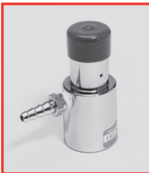
No. 1308A Fixed flow regulator (6 LPM Avg.) with CGA-540 thread, screws on easily by hand to MadaValve Cylinders.