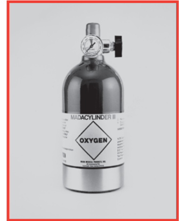
No. 1303ME MadaCylinder III Ultra-lightweight oxygen cylinder. Built in contents gauge.