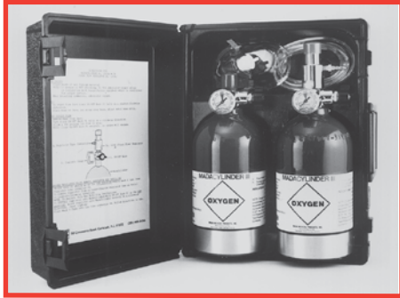
No. 1300ME Oxy-Uni-Pak (2) 1303ME MadaCylinder III's, 1308A fixed flow regulator (6 LPM Avg.) mask and tube, carry case.