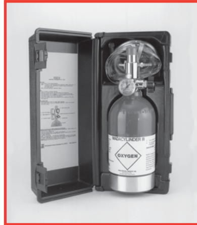
No. 1301ME Oxy-Uni-Pak Contains: one 1303ME MadaCylinder III, 1308A fixed flow regulator (6 LPM Avg.) mask and tube, in carry case.