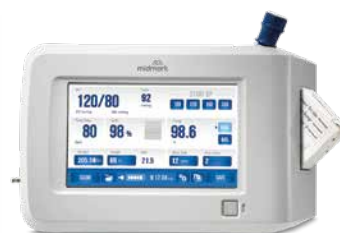
MIDMARK® DIGITAL VITAL SIGNS DEVICE