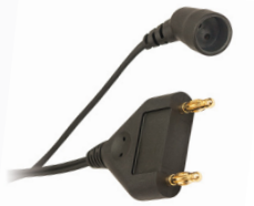
A827V – Bipolar cable