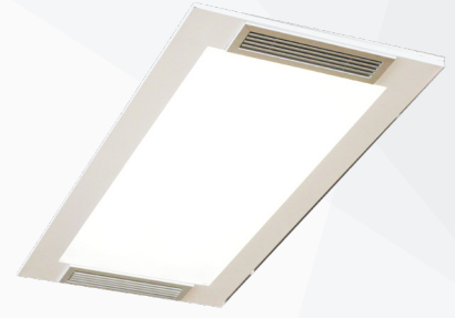
UV24 UV-C air purification