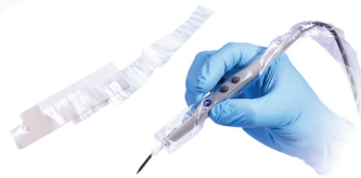
A910ST – Disposable handpiece and cord sheath, sterile