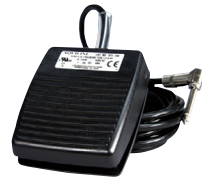
A803 – Footswitch (for A942/A952)