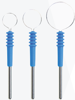
Tungsten wire loop electrodes