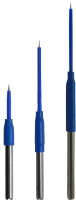
Microdissection needle electrodes