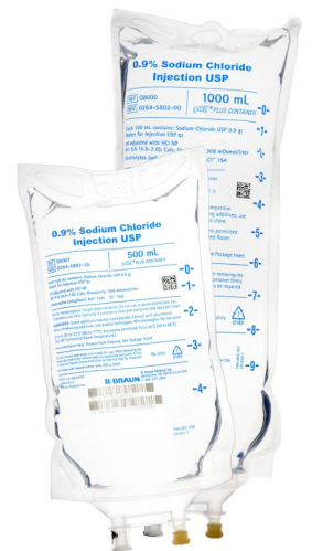
NEW EXCEL® Plus IV Solution Containers