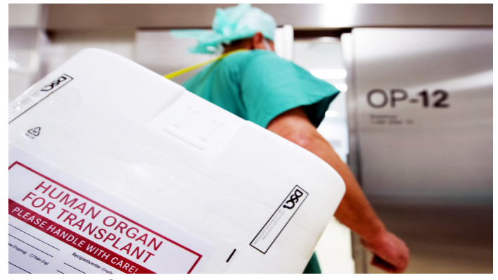
Blood & Organ Transport