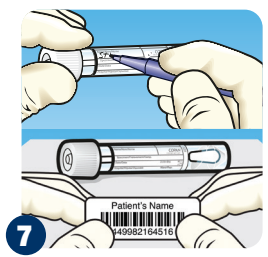
Screw the cap back onto the tube and apply patient identification label or write patient information on the tube label.