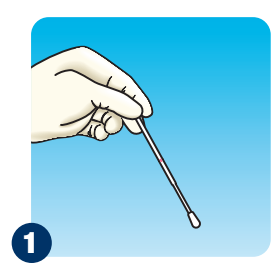
Remove the swab from its packaging, holding by the end of the applicator and identify the breaking point.