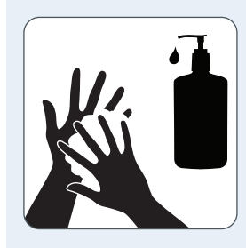
Wash hands with soap and water.

This guide is for Illustration Purposes Only. Always read the manufacturer's package insert for specific instructions regarding specimen collection and transport for the type of test kit being used.