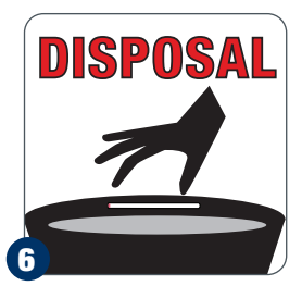
Discard the broken part of the applicator into an approved waste disposal container.