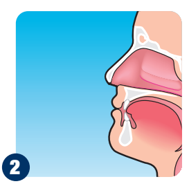
Position head slightly back.