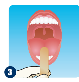
Depress the tongue so that the back of the throat can be seen.