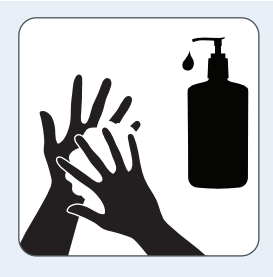
Wash hands with soap and water and don personal protective equipment.