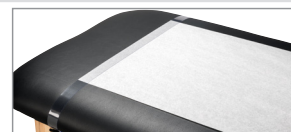
040- Paper Cutter